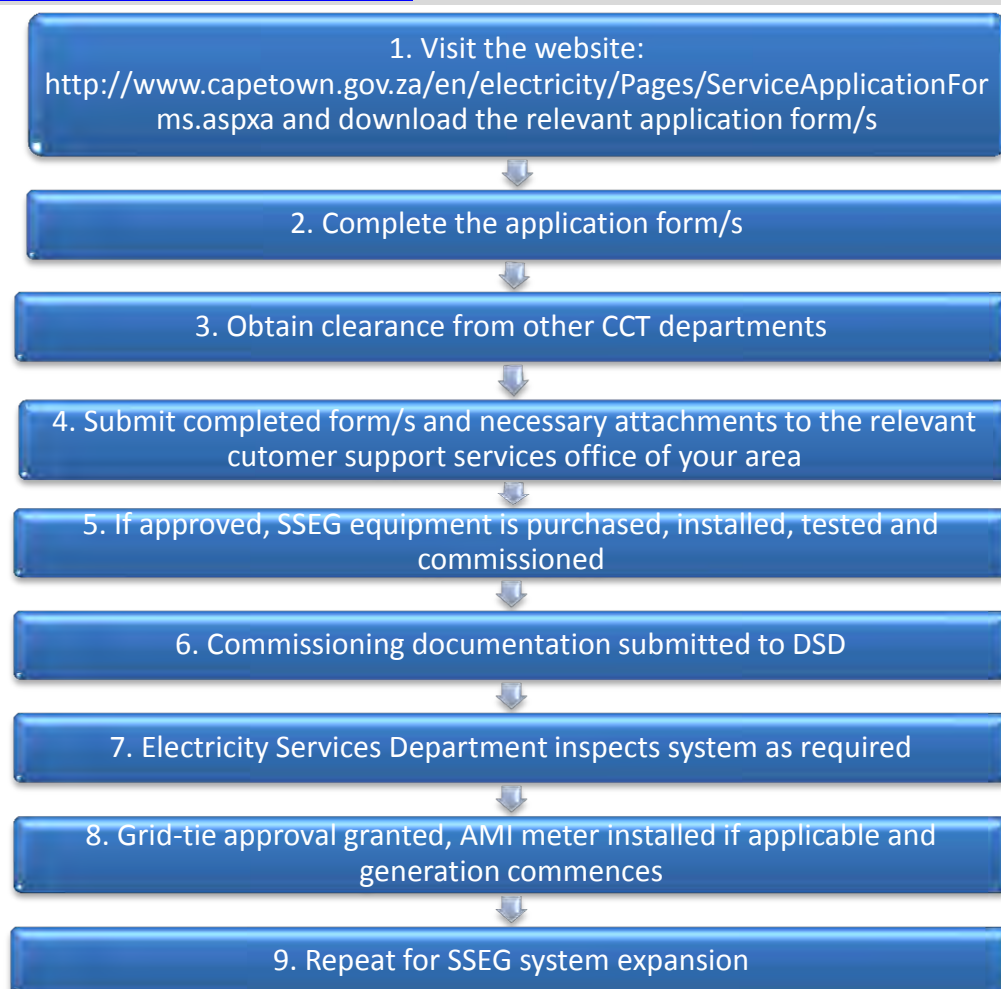
Figure 1: Summary of SSEG application and approval process.

Professional sign off: The final installed SSEG system must be signed off on commissioning as complying with the City’s requirements by a professional engineer or technologist registered with ECSA. For more information regarding professional personnel, visit: https://www.ecsa.co.za/default.aspx